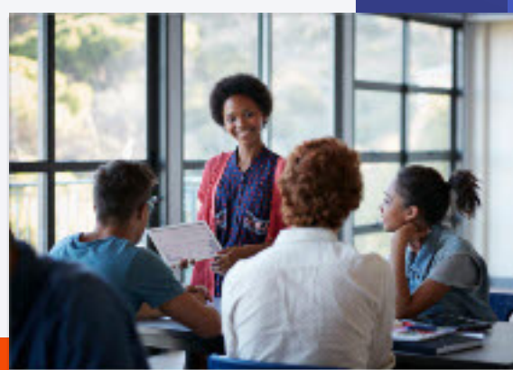
12 Opportunities for Leadership in College Want to take on a leadership role in college? Learn places to challenge yourself and expand your horizons when it comes to college leadership. ThoughtCo

1 College is a great place to get valuable leadership experience for your resume. Even though you probably won't start out as a CEO somewhere, employers are always looking for people who can lead projects or programs and then work their way up.